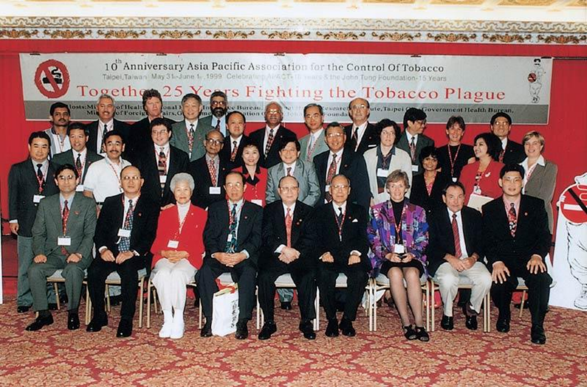
10 th Anniversary Asia Pacific Association for the Control of Tobacco