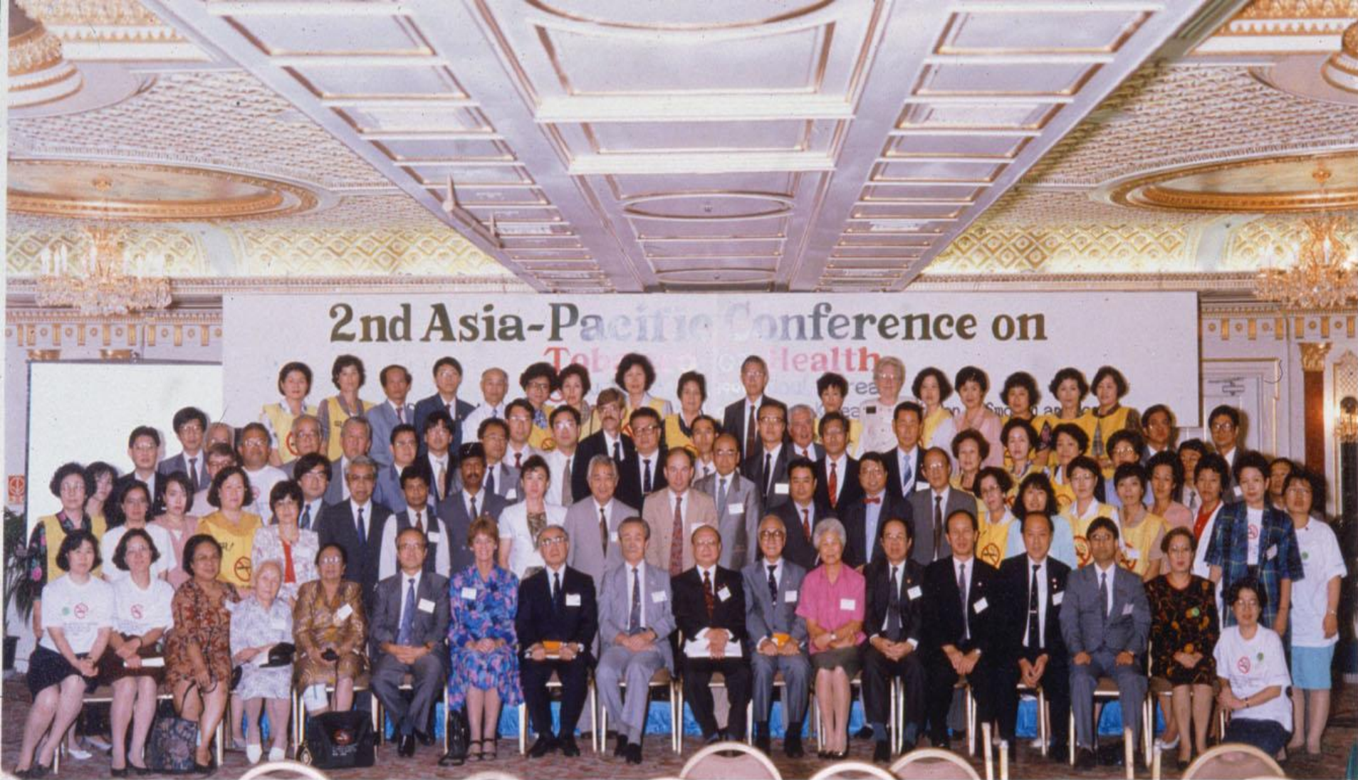
2nd Asia-Pacific Conference on Tobacco or Health August 28th-30th, 1991, Lotte Hotel, Seoul, Korea